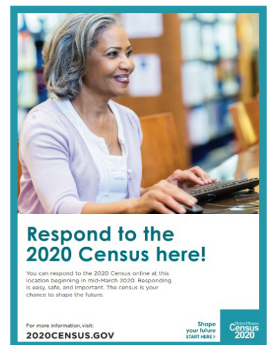
Response location poster, downloadable from 2020census.gov

DON'T: Solicit individuals’ responses or purport to be a Census Bureau representative; see the Census Bureau’s guidance for partners .